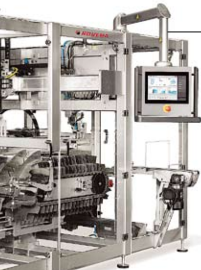
The ETIL end-of-line packaging machine for trays with lids enables a particularly precise and product-friendly packaging process. Electronic SIKO position indicators for monitored size changeover can be integrated as an option.