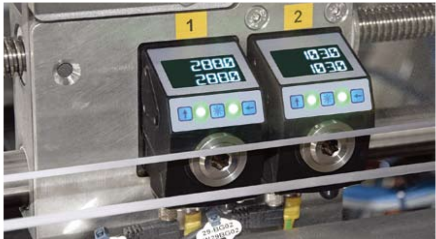
Electronic position indicators AP10 from SIKO for size changeovers: The status LEDs light up green, as the actual and target values match precisely.

thus developed the AP10 with an IO link interface, which can be easily and safely integrated into machine control systems.” Ingo Hamel: “We consider SIKO to be a very innovative and future-oriented company that develops and advances many innovations. We also reap the benefit of that.”